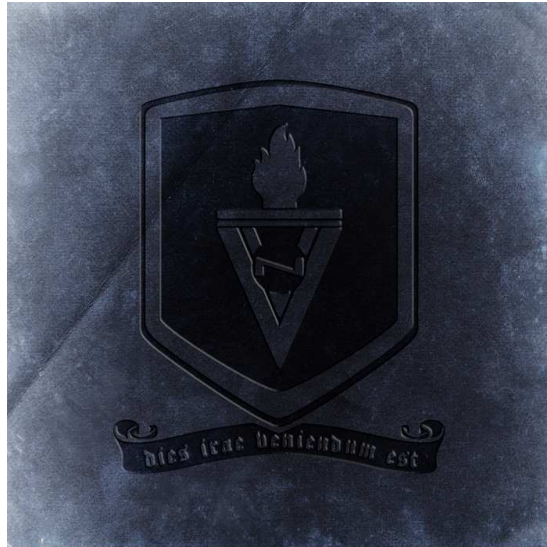
Reformation 1, ANA-AV-1, Release 24.04.09

"We spent a lot of time in 2008 planning what our releases should be like from now on and this is part of the results. The original idea for Reformation was to replace the need for singles by releasing an EP or Album containing remixes, alternate versions and live versions of tracks from the album Matter and Form. We never abandoned the plan and, as ideas grew, Reformation evolved into something much bigger and better. Reformation 1 will be part of a series to release special material to our fans. We put a lot of work into this and we're very proud of the results. We hope you will be too".